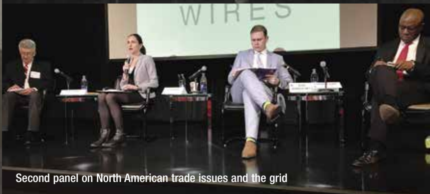
Second panel on North American trade issues and the grid