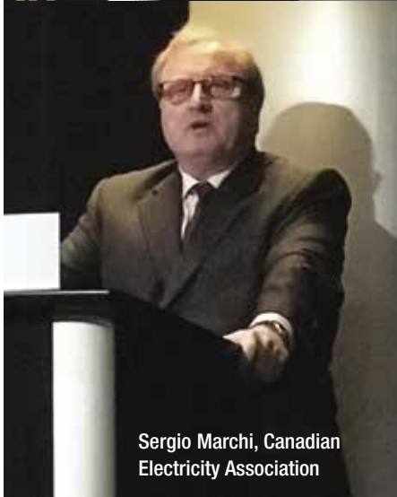
Sergio Marchi, Canadian Electricity Association